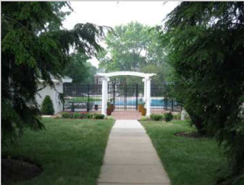
The beautiful entrance to the Fairlington Glen pool complex.

Built in 1974 with a small pool house and rest rooms, the pool area by 2006 was showing its age and inadequacy. It had not been built to house an onsite staff and maintenance area. This area grew by accretion as the Glen took over management from CBI Fairmac, the original developer and management agent for all of Fairlington. Change was needed to provide an enhanced recreational area for pool users and workspace for Glen staff.