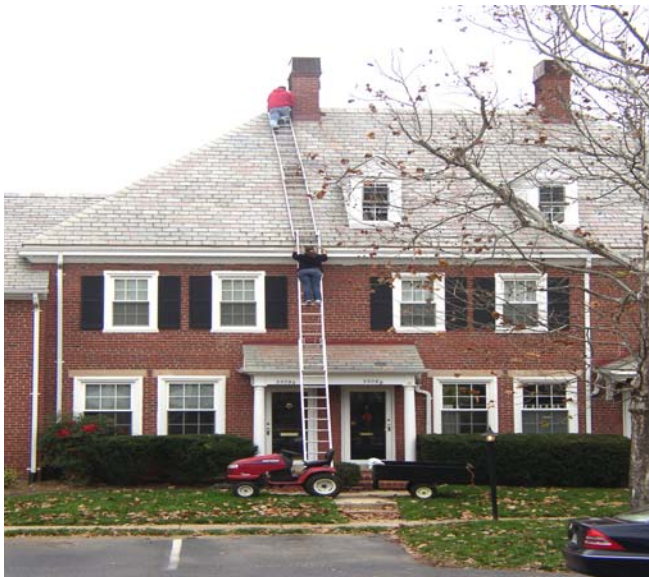
Glen Staff scaling the heights in Court 1.

REMEMBER: NO TRASH PICK UP ON DECEMBER 25 OR JANUARY 1