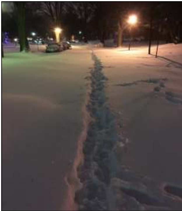
Looking down S. 36th Street from the intersection with S. Taylor Street when only walkers traveled this road.