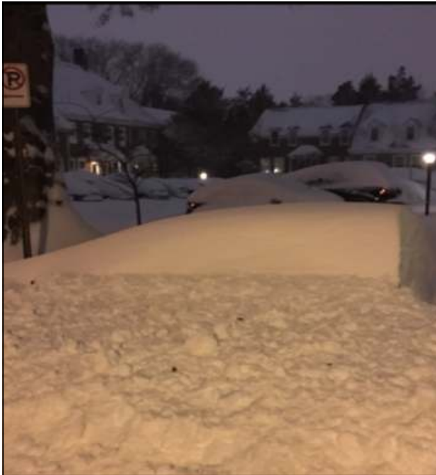
Yes, that's a car under all that snow! This car was plowed in and snow covered while parked on S. Stafford Street.