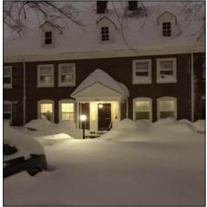
A picture that could have been taken in any court in Fairlington. This one from Court 12 just after the snow stopped.