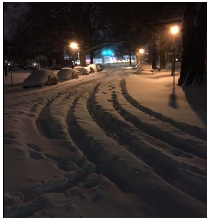
Tire tracks and footprints in the snow on S. Taylor Street with the Bradlee Shopping Center in the background.