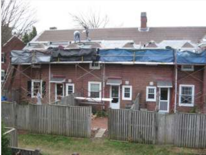
Workers for the roofing contractor replace a slate roof on S. Stafford Street as part of our roof replacement program.

To some, 70 is the new 60, or even 50. But Fairlington Glen really is 70 years old, having been built during World War II as housing for workers at the Pentagon. She sometimes feels her age. What does that mean to you? It means that a big focus of our Board is on repair and replacement of "infrastructure." It also means that more than one third of our monthly condo fees goes to "Reserves" that are set aside to keep that infrastructure in good condition so as to maintain our investment in our homes and community.