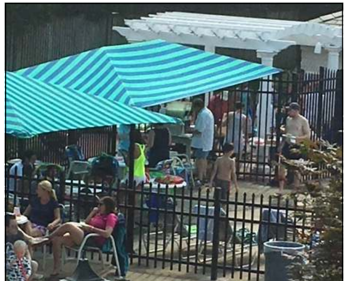
While inside the pool's canopied areas folks enjoyed their burgers and hot dogs.