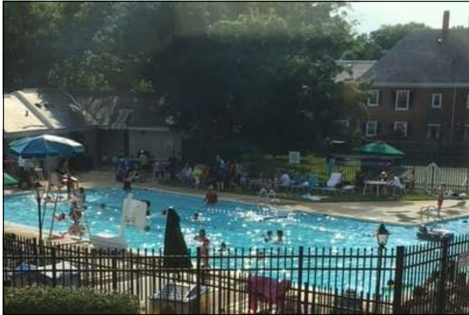
Residents gathered at the Glen pool on a sunny Sunday afternoon to celebrate the start of the summer, to cool off in the water, and to spend time with their neighbors.

Fairlington Glen residents welcomed the start of summer with a pool party on Sunday, June 17 (Father's Day). Volunteers grilled hot dogs, hamburgers, and veggie burgers while residents supplemented the menu by bringing desserts, salads and/or side dishes. These parties are always a lot of fun and provide a great opportunity to meet & mingle with your neighbors - both new and old!