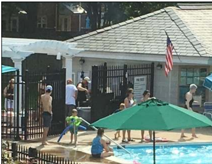
Volunteers did the grilling outside of the pool's entrance.