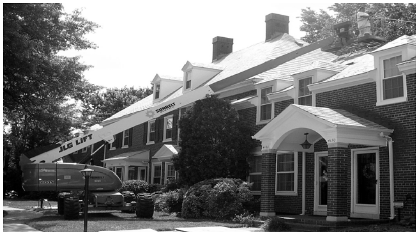
Pictured in Court 6 is an articulated manlift (manufactured by JLG Lift) being used by Middledorf Painting Company, our contractor. The lift is being used to ease the painting of upper elements of our buildings, and to minimize the need for placing ladders over our shingled roofs. This is the first time such equipment has been used for painting in the Glen.