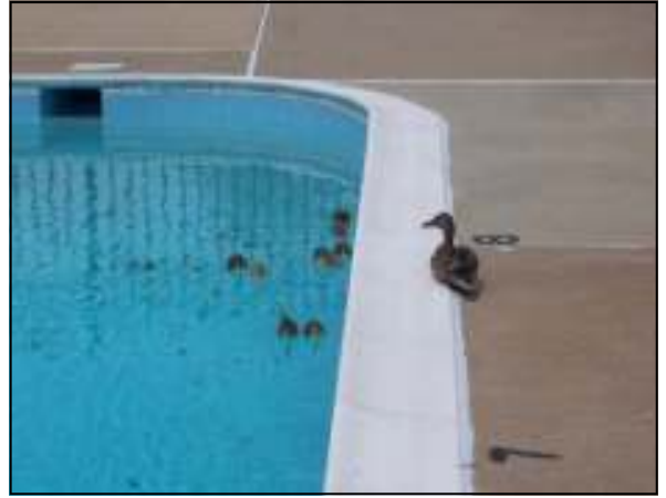
A mother duck and her ducklings at the Glen pool in 2015.

In a situation like this, please contact Arlington County Animal Control and our property manager for help.