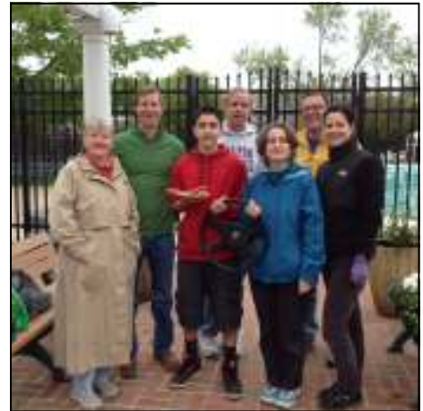
Glen volunteers smile after enjoying pizza and our spring clean up.

Glen volunteers were at it again on Saturday, April 25 for our 2nd annual Spring Clean Up & Planting Day, and it was another successful day of work & fun. Trash was picked up along the interior and exterior perimeter fences on King Street and Quaker Lane. Among the items found was a BMW steering wheel, seen in the picture at the right.