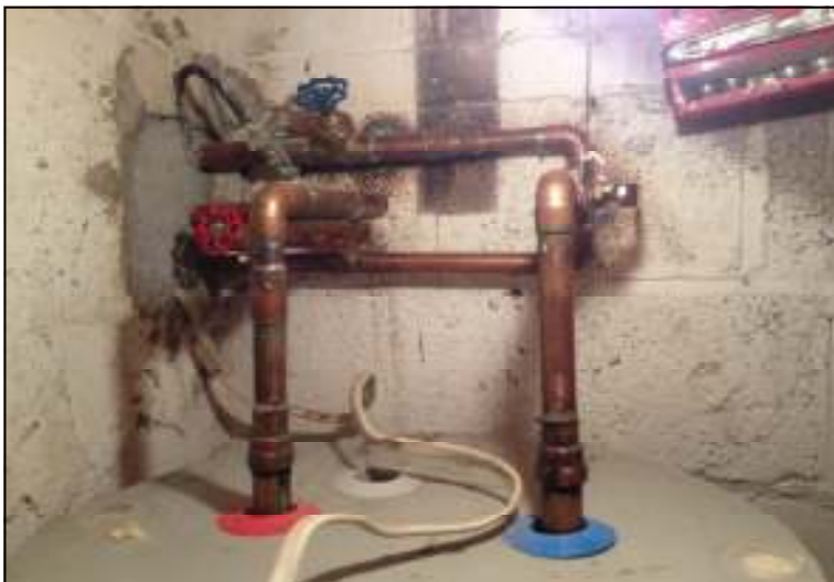
A Clarendon basement water heater closet. The blue knob on top is the main water line cutoff valve to the unit.

The valve behind the disposal under the sink controls the water to the patio (except in the Barcroft where it is in the utility room above the hot water heater). The valve that controls the water to the front outside faucet is located in the water heater closet. In the Barcroft, the valve for the front outside faucet is located downstairs in the utility room, usually above the hot water heater. The larger valve (blue knob below) above the water heater turns off the main water line.