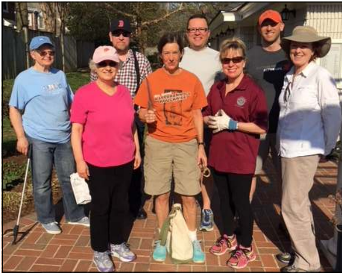
Glen volunteers pose for a photo before getting to work on Spring Clean Up Day.