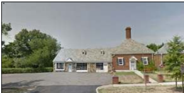
The preschool will occupy the former Frosty's location.

In October, the Arlington County Board voted to approve a use permit at 3120 S. Abingdon Street in Fairlington for a new STEM (science, technology, engineering, and math) preschool.