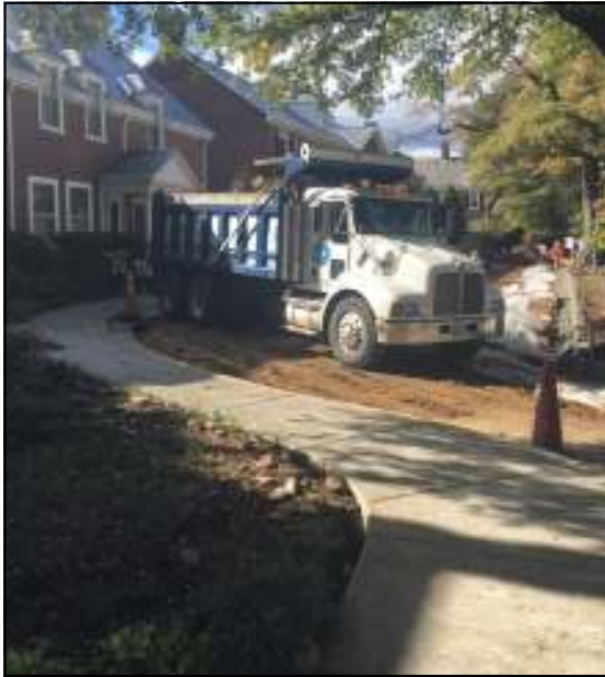
Concrete has already been poured for the new sidewalks in Court 14.

Renovation of Court 14's parking lot, including replacement of all adjacent sidewalks and curbing, began on October 22, 2018. The Board approved a contract with Pro-Pave on April 10, 2018 in the amount of $68,831 (a reserve fund expenditure) for this project. Our neighbors in Court 14 are currently dealing with a major inconvenience and having to find street parking for their cars until this project is complete.