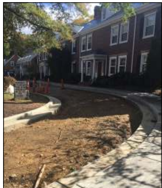
The previous lot was milled and the new lot will soon be paved and marked.