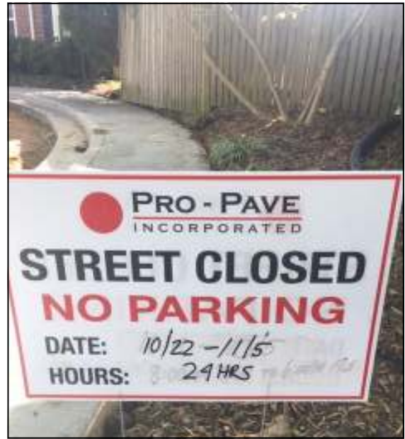
The Glen Board contracted with Pro-Pave for this project, which will take a minimum of two weeks.