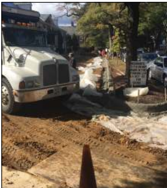
Crews are working on the new curbs and gutters in Court 14's lot.