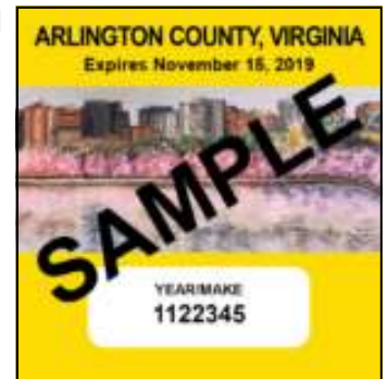
Arlington's 2019 car decal

The County first began requiring drivers to display a metal tag on license plates in 1949. Arlington moved to a decal system in 1967.