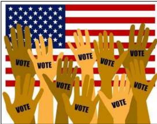
Co-owners are reminded to please vote in the upcoming Glen election.

A quorum is the minimum number of co-owners who must be at a meeting before business can be transacted. For example, at a monthly Board meeting there must be at least three of the five Board members present to conduct a meeting. And for our Annual Meeting, there must be a quorum consisting of more than 25% of ownership interests to conduct business.