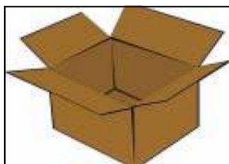
Not like this!

Whether you still put your cardboard out with the weekly recycling or with your household garbage, please note that it's important to spend a moment breaking the boxes down before you put them outside.