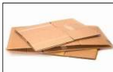
But rather, like this!

NOTE: If you are placing cardboard out on recycling day, please put these boxes, after you break them down, onto the ground. Do not put cardboard into the recycling bins. It just takes up too much room that is otherwise needed for glass, plastic, and aluminum items.