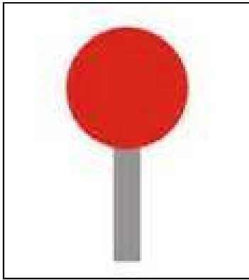
Gardening in common areas requires a red reflector.

Spring is oh so near, and thoughts are turning to gardening. If you have a red reflector in the front and/or side (if an end unit) plant bed, please rake the leaves out and trim your bed so it is ready for our contractor to spread mulch.