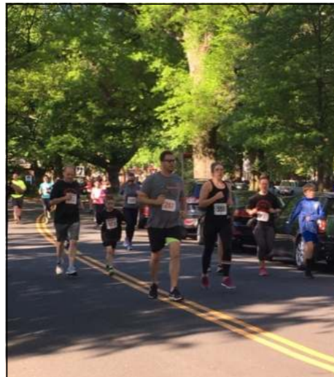
Runners and walkers of all ages took part in the 6th annual benefit event.