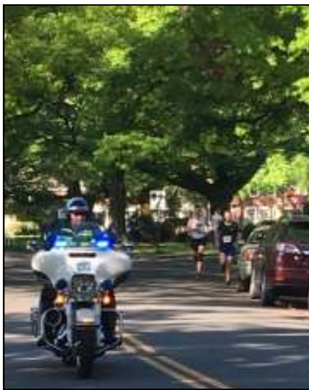
Arlington County Police lead the way for Fairlington 5K runners on April 27.