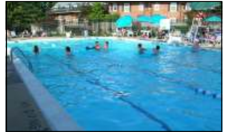
Swimmers enjoying the Glen Pool.