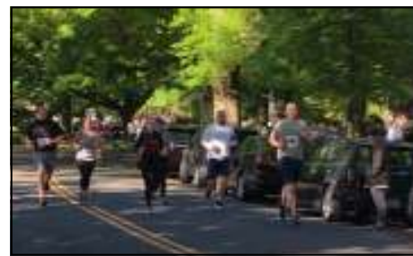
Exercising for a great cause.