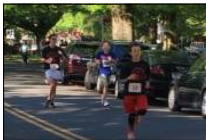
Even the kids had fun!