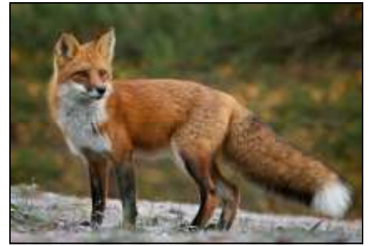
Fox, like this, are known to live near Fairlington

Animal Control responded to the 2800 block of S. Columbus Street in Arlington on Saturday April 25th in the afternoon in response to a call about a fox attacking a domestic cat. Shortly thereafter, another call came in regarding an additional cat being attacked by a fox in close vicinity. Animal Control officers were unable to locate the suspect fox at that time.