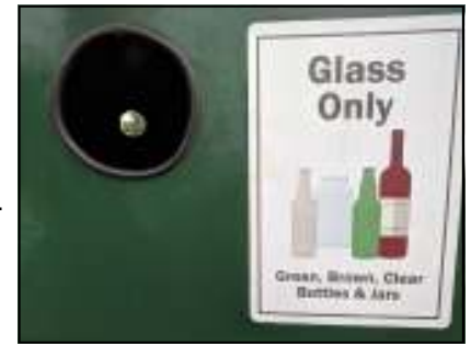
Drop glass recycling into the hole.

For just glass jars and bottles, recycle those items at these locations: