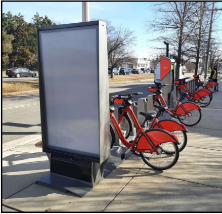
Capital Bikeshare's newest location near the Bradlee Shopping Center.

Capital Bikeshare is metro DC's bikeshare service, with 5,000 bikes and 600+ stations across seven jurisdictions: Washington, DC.; Arlington, VA; Alexandria, VA; Montgomery, MD; Prince George's County, MD; Fairfax County, VA; and the City of Falls Church, VA. Designed for quick trips with convenience in mind, it's a fun and affordable way to get around.