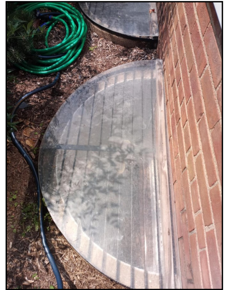
An example of a flat Plexiglass window well cover in the Glen.

NOTE: For a fee to cover costs, our onsite crew will install Plexiglass covers for you. Simply contact Nelson Ordoñez and María Castro at fairlingtonglen-staff@hotmail.com to make arrangements.