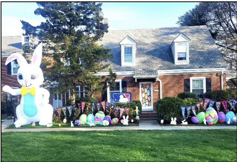
The always-decorative Court 4 as captured in this pic taken from Facebook.