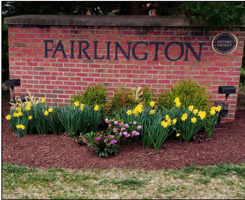
The spring flowers are in bloom and proclaim "welcome" at the entrance to the Glen from Quaker Lane.

Most Glen residents will agree that spring is such a beautiful time to be in Fairlington Glen. Here are some examples.