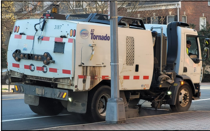
Arlington County's street sweepers will be rolling out this month to clean the streets of Arlington County.

Arlington County's annual street sweeping season begins this month and continues through October. Street sweeping removes accumulated debris and pollutants, such as sand, salt, metals, petroleum products, and bacteria, before they wash into streams, the Potomac River, and the Chesapeake Bay.