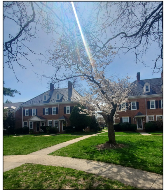
The sun is shining and the trees are blooming in Court 15.