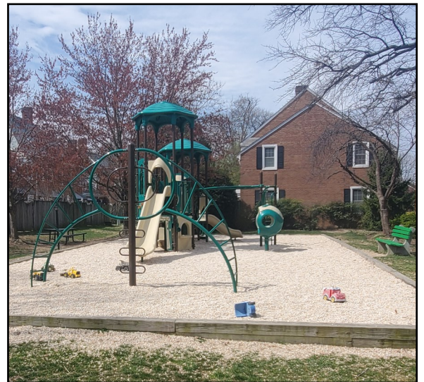
With the longer days and the warmer temps, the Glen's tot lot will likely be busy this spring.