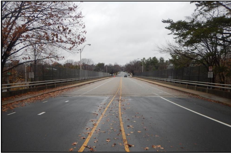
The 53-year-old S. Abingdon Street bridge over I-395 is pictured last winter. Structural repairs began in June.

Work is underway to rehabilitate the S. Abingdon Street bridge over I-395 to improve driver, bicyclist and pedestrian safety and extend the overall life of the bridge, according to the Virginia Department of Transportation (VDOT). The bridge, located between the King Street (Route 7, Exit 5) and Shirlington Circle (Exit 6) interchanges, was built in 1970 and later rehabilitated in 1994. Many in Fairlington call this the bridge that connects North and South Fairlington.