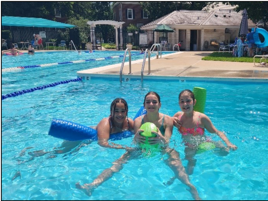
There's nothing like meeting your friends at the pool and enjoying the sun and the water together.