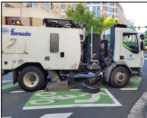
Coming soon to the streets of Fairlington.

Arlington County's annual street sweeping season is winding down, and the last scheduled event of 2024 for Fairlington is September 11.