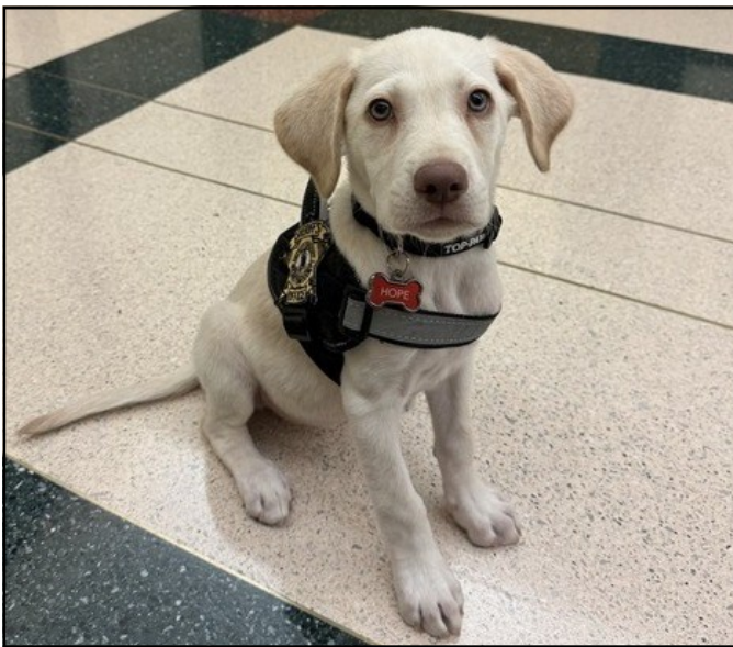
Meet Hope, the newest member of the Arlington County Sheriff's Office.

The Arlington County Sheriff's Office (ACSO) has a new member - a K9 puppy. Hope is a yellow labrador retriever, and she will serve as a wellness dog providing emotional support for the ACSO staff and interacting with the Arlington community at public events.