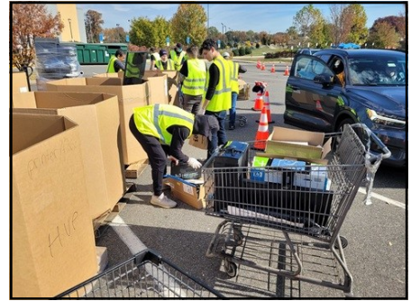
E-CARE staff sort through HHM's.

This event, which allows Arlington residents to quickly and safely dispose of household hazardous materials (HHM's) and old electronics, will be held rain or shine.