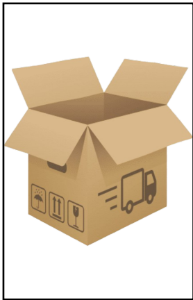
NOT like this!

It's quick. It's easy. And it's oh so important. Please make an effort. Thanks!