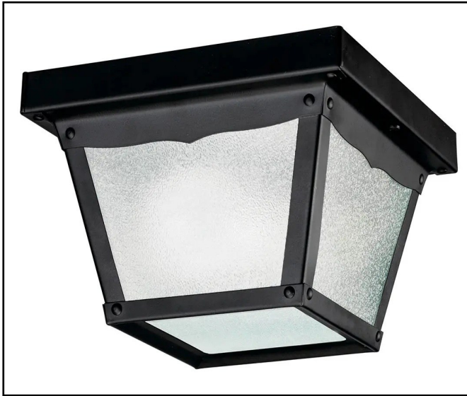
Replacing front stoop lights is a co-owner responsibility. Here's a suggested replacement from Kichler.

Recently on the Fairlington Facebook page, someone asked about the maintenance and replacement of a unit's front porch light. These lights are the co-owner's responsibility.