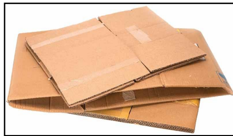
But rather, like this!