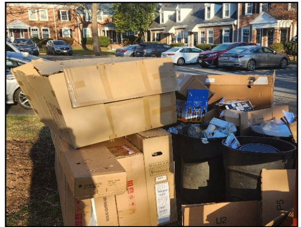
A perfect example of what not to do with empty boxes. Please take the time to flatten them.

NOTE: If you are placing cardboard out on recycling day, please put all boxes, after you break them down, onto the ground. Do not put cardboard into the recycling bins. It just takes up too much room that is otherwise needed for plastic and aluminum items.